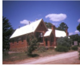
1 guildford primary school number 264 franklin street guildford corner view jan1989