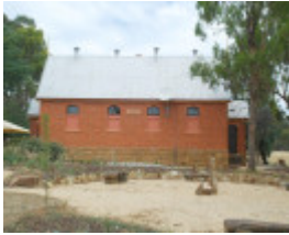
GUILDFORD PRIMARY SCHOOL NO. 264 SOHE 2008