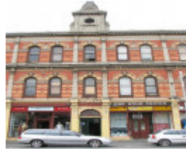
SHOPS SOHE 2008