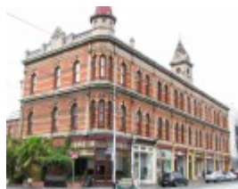
SHOPS SOHE 2008