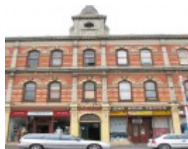
SHOPS SOHE 2008