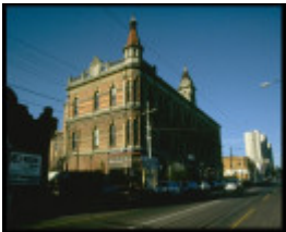
h00559 236 252 brunswick street