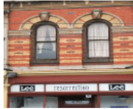
SHOPS SOHE 2008