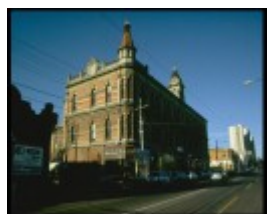
h00559 236 252 brunswick street