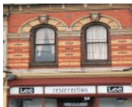
SHOPS SOHE 2008