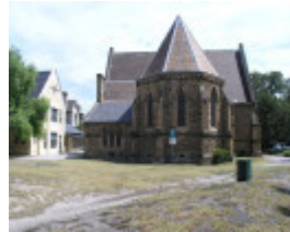
CHRIST CHURCH COMPLEX SOHE 2008