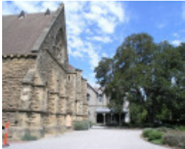
CHRIST CHURCH COMPLEX SOHE 2008