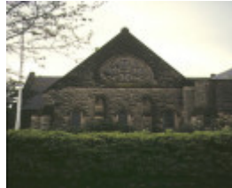
1 christ church complex church square st kilda west front of church