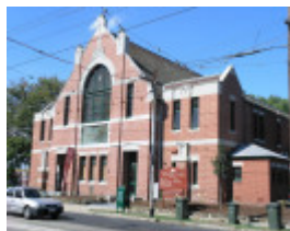
ALL SAINTS CHURCH, HALL AND FORMER VICARAGE SOHE 2008