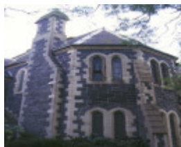
1 all saints church hall & former vicarage chapel street east st kilda rear view of church may1997