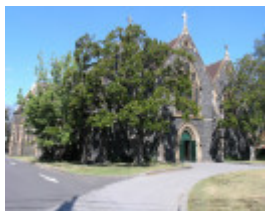
ALL SAINTS CHURCH, HALL AND FORMER VICARAGE SOHE 2008