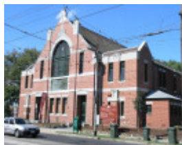
ALL SAINTS CHURCH, HALL AND FORMER VICARAGE SOHE 2008