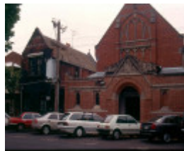
St Marks George St Fitzroy Parish Hall