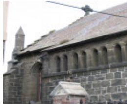
ST MARKS ANGLICAN CHURCH SOHE 2008