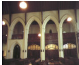
st marks anglican church george street fitzroy interior nave arches jul1980