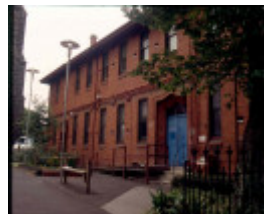
St Marks Anglican Church George Street Fitzroy Community Centre