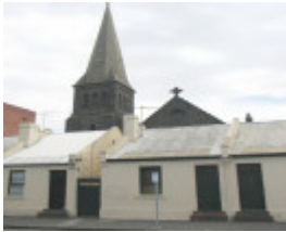
ST MARKS ANGLICAN CHURCH SOHE 2008