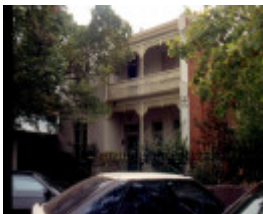
St Marks George St Fitzroy Vicarage