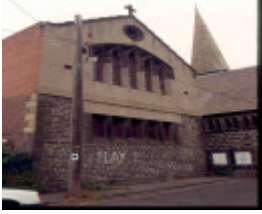
St Marks George St Fitzroy Former Sunday School