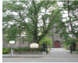
ST MARKS ANGLICAN CHURCH SOHE 2008