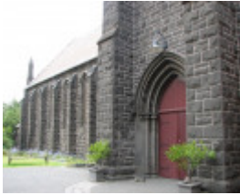
ST MARKS ANGLICAN CHURCH SOHE 2008