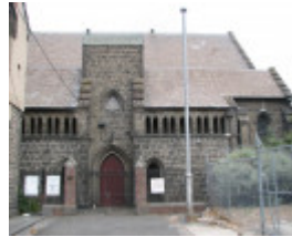
ST MARKS ANGLICAN CHURCH SOHE 2008