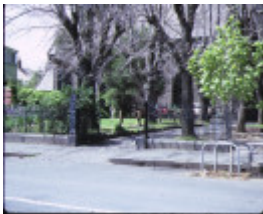
1 st marks anglican church george street fitzroy front view oct1986