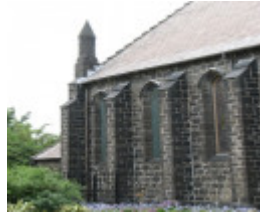
ST MARKS ANGLICAN CHURCH SOHE 2008