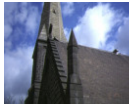
st marks anglican church george street fitzroy spire view