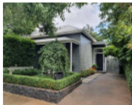
38-38A Edsall Street, Malvern 38-38A Edsall Street, Malvern