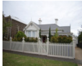
FORMER WESLEYAN CHURCH, PARSONAGE AND COMMON SCHOOL SOHE 2008