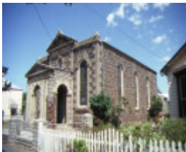
former wesleyan church parsonage & common school james street port fairy front corner view of church feb1990