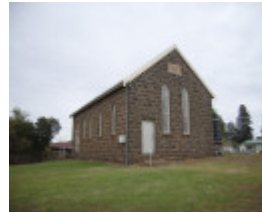
FORMER WESLEYAN CHURCH, PARSONAGE AND COMMON SCHOOL SOHE 2008