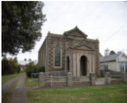
FORMER WESLEYAN CHURCH, PARSONAGE AND COMMON SCHOOL SOHE 2008