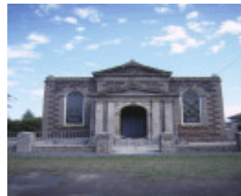
Former Wesleyan Church Parsonage & Common School James Street Port Fairy Front View of Church February 1990