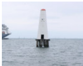
LEADING LIGHTS SOHE 2008