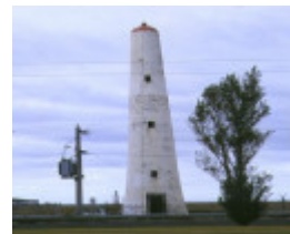
1 leading lights beach road port melbourne view of inner leading light