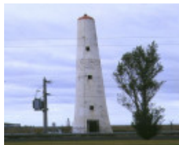
1 leading lights beach road port melbourne view of inner leading light