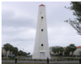
LEADING LIGHTS SOHE 2008