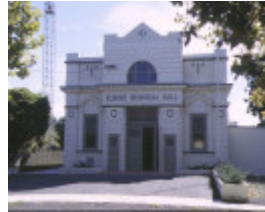
1 the athenaeum & memorial hall michie street elmore memorial front view apr1998