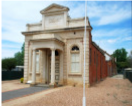
THE ATHENAEUM AND MEMORIAL HALL SOHE 2008