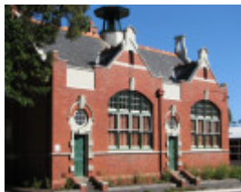
PRIMARY SCHOOL NO. 734 SOHE 2008