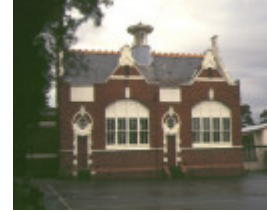
1 primary school number 734 dandenong road clayton front view