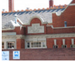
PRIMARY SCHOOL NO. 734 SOHE 2008