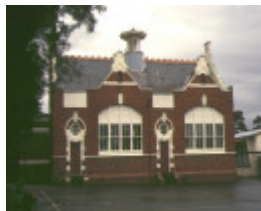
1 primary school number 734 dandenong road clayton front view