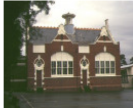
1 primary school number 734 dandenong road clayton front view