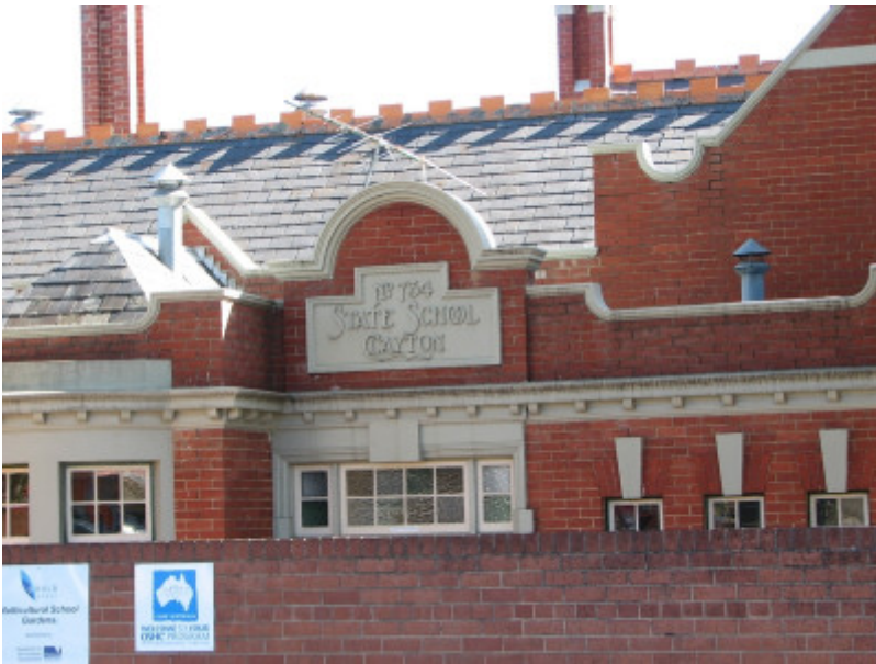
PRIMARY SCHOOL NO. 734 SOHE 2008