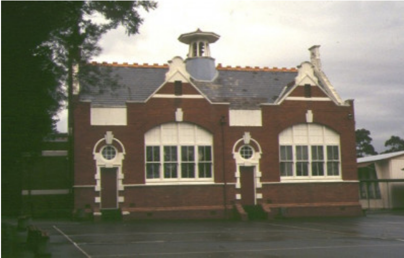
1 primary school number 734 dandenong road clayton front view