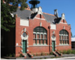
PRIMARY SCHOOL NO. 734 SOHE 2008