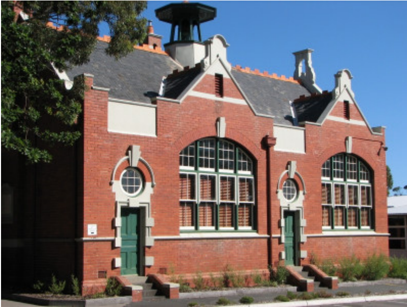
PRIMARY SCHOOL NO. 734 SOHE 2008