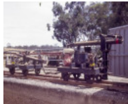
h00993 torrumbarry weir lock chamber steam boiler and steam winch complex torrumbarry drop bar hydraulic operated she project 2004