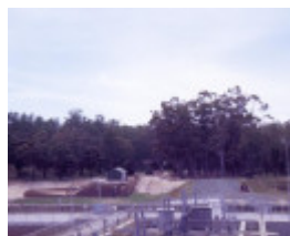
h00993 torrumbarry weir lock chamber steam boiler and steam winch complex torrumbarry view of site she project 2004