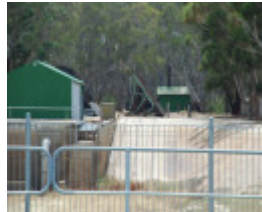
TORRUMBARRY WEIR LOCK CHAMBER, STEAM BOILER AND STEAM WINCH COMPLEX SOHE 2008