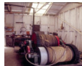
h00993 torrumbarry weir lock chamber steam boiler and steam winch complex torrumbarry winch house interior she project 2004