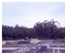
h00993 torrumbarry weir lock chamber steam boiler and steam winch complex torrumbarry view of site she project 2004