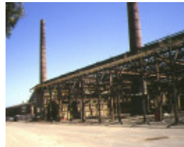
1 wunderlich terra cotta tile works demolished mitcam road vermont view of chimneys nov1993