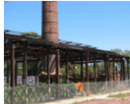
WUNDERLICH/MONIER TERRACOTTA ROOF TILES COMPLEX SOHE 2008