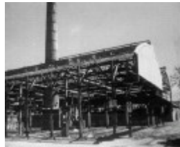
1 wunderlich terra cotta tile works demolished mitcam road vermont view structure