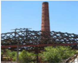
WUNDERLICH/MONIER TERRACOTTA ROOF TILES COMPLEX SOHE 2008