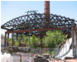
WUNDERLICH/MONIER TERRACOTTA ROOF TILES COMPLEX SOHE 2008