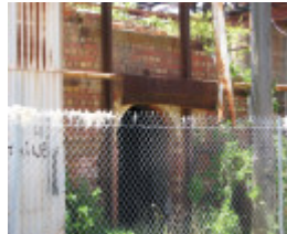
WUNDERLICH/MONIER TERRACOTTA ROOF TILES COMPLEX SOHE 2008