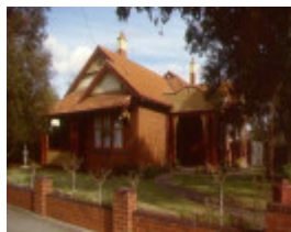
1 59 champion rd williamstown pm2 aug1999