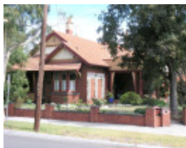
FORMER DEPUTY MANAGER'S RESIDENCE, NEWPORT RAILWAY WORKSHOPS SOHE 2008