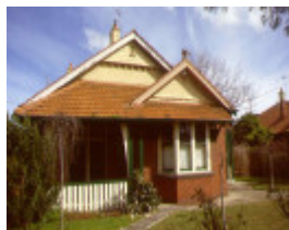
1 57 champion rd williamstown pm2 aug1999