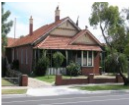
FORMER MANAGER'S RESIDENCE, NEWPORT RAILWAY WORKSHOPS SOHE 2008