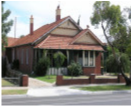
FORMER MANAGER'S RESIDENCE, NEWPORT RAILWAY WORKSHOPS SOHE 2008