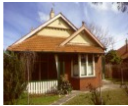
1 57 champion rd williamstown pm2 aug1999