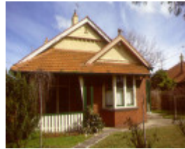
1 57 champion rd williamstown pm2 aug1999