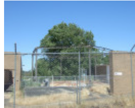
HAMILTON GAS HOLDER SOHE 2008