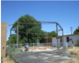
HAMILTON GAS HOLDER SOHE 2008