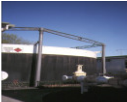
1 hamilton gas holder craig street hamilton gas holder