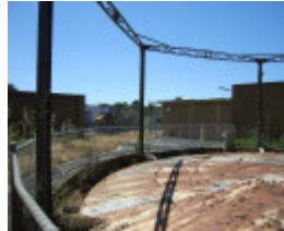
HAMILTON GAS HOLDER SOHE 2008