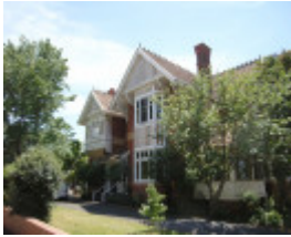
NAPIER CLUB SOHE 2008