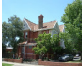
NAPIER CLUB SOHE 2008