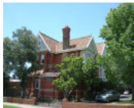
NAPIER CLUB SOHE 2008