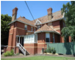
NAPIER CLUB SOHE 2008