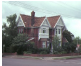
1 napier club thompson street hamilton front view nov1980