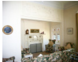
NAPIER CLUB SOHE 2008