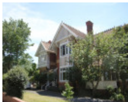
NAPIER CLUB SOHE 2008