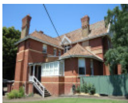
NAPIER CLUB SOHE 2008