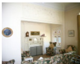
NAPIER CLUB SOHE 2008