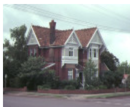
1 napier club thompson street hamilton front view nov1980