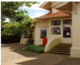
H01178 myrniong side2 feb2003