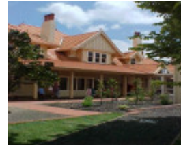
H01178 myrniong back2 feb2003