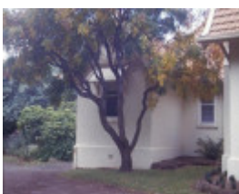
h01178 myrniong cnr kent and macarthur st hamilton rear roof line she project 2003