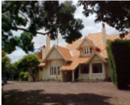
H01178 1 myrniong front feb2003