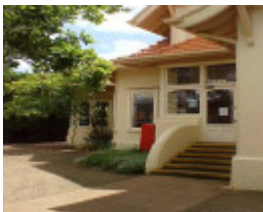
H01178 myrniong side2 feb2003