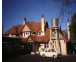
H01178 myrniong hensley park road hamilton front view aug1994