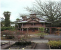
1 state nursery office creswick front view sep1989