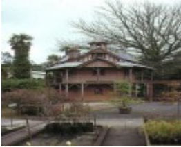
1 state nursery office creswick front view sep1989