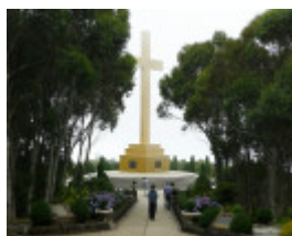
MACEDON CROSS SOHE 2008