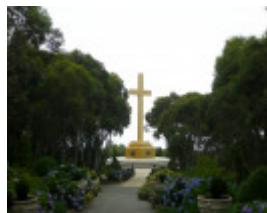
MACEDON CROSS SOHE 2008