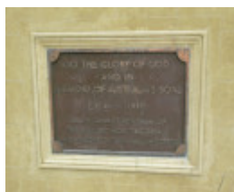
MACEDON CROSS SOHE 2008