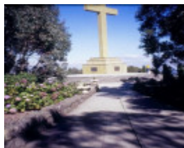
h01027 1 macedon cross cameron drive mt macedon approach she project 2003