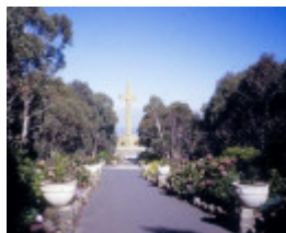
h01027 macedon cross cameron drive mt macedon cross she project 2003