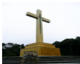
MACEDON CROSS SOHE 2008