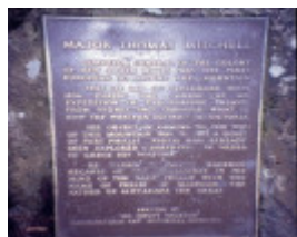
h01027 macedon cross cameron drive mt macedon plaque she project 2003