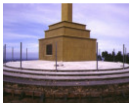
h01027 cameron memorial cross cameron drive mount macedon cross base