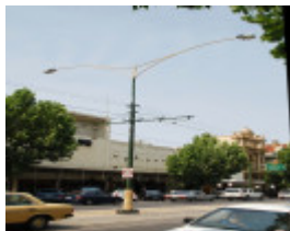
ORNAMENTAL TRAMWAY OVERHEAD POLES SOHE 2008