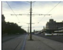
1 tramway poles bendigo street view apr1997