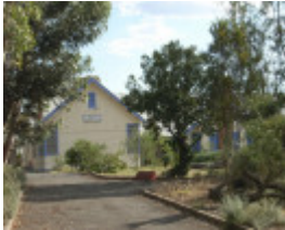
FORMER MURRAYVILLE CONSOLIDATED SCHOOL SOHE 2008