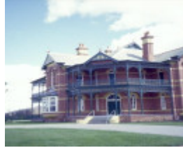
h01091 1 bundoor homestead snake gully drive bundoor close up homestead she project 2003