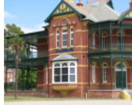
BUNDOORA PARK HOMESTEAD SOHE 2008