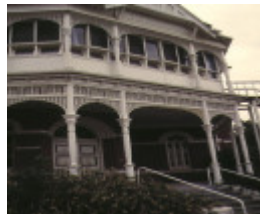
J V Smith Homestead Bundoor Entry February 1995