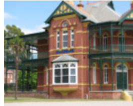
BUNDOORA PARK HOMESTEAD SOHE 2008