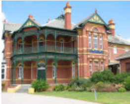
BUNDOORA PARK HOMESTEAD SOHE 2008