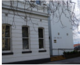
4679 Town Hall 1251 High Street Malvern Addition at Rear 1