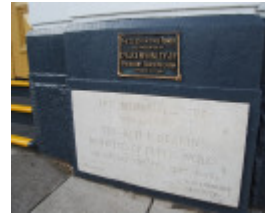
4679 Town Hall 1251 High Street Malvern Plaque 1