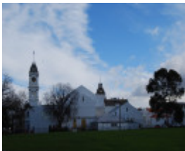
4679 Town Hall 1251 High Street Malvern Rear 1