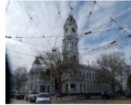
4679 Town Hall 1251 High Street Malvern View North East 1