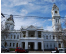
4679 Town Hall 1251 High Street Malvern View East 1