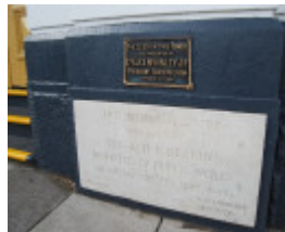
4679 Town Hall 1251 High Street Malvern Plaque 1