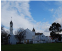
4679 Town Hall 1251 High Street Malvern Rear 1