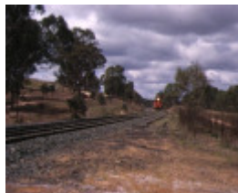
1 ravenwood railway siding view of lines 1994