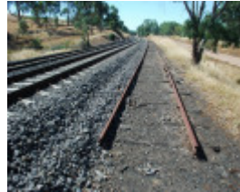
RAVENSWOOD RAILWAY SIDING SOHE 2008