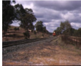
1 ravenwood railway siding view of lines 1994