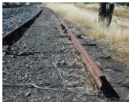
RAVENSWOOD RAILWAY SIDING SOHE 2008