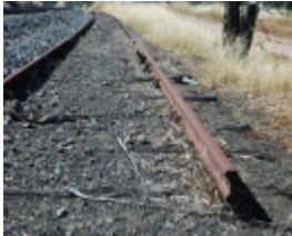
RAVENSWOOD RAILWAY SIDING SOHE 2008