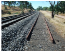
RAVENSWOOD RAILWAY SIDING SOHE 2008