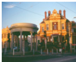
Kew War Memorial 2004