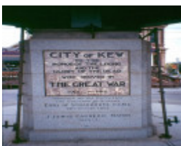
Kew War Memorial Honour Board 2004