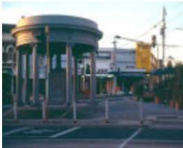
Kew War Memorial 2003