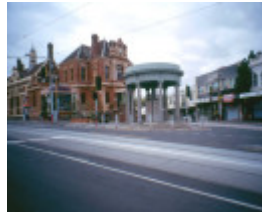
Kew War Memorial 2004