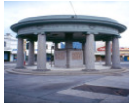
Kew War Memorial 2004