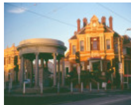
Kew War Memorial 2004