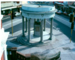
Kew War Memorial 2004