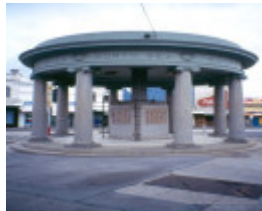
Kew War Memorial 2004