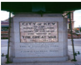
Kew War Memorial Honour Board 2004