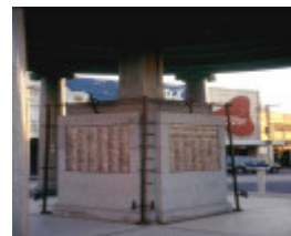
Kew War Memorial Honour Board 2004