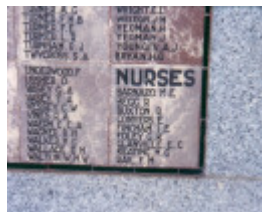
Kew War Memorial Honour Board 2004