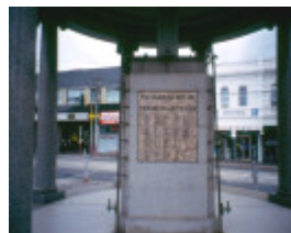
Kew War Memorial Honour Board 2004