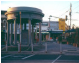
Kew War Memorial 2003