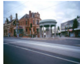
Kew War Memorial 2004