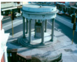
Kew War Memorial 2004