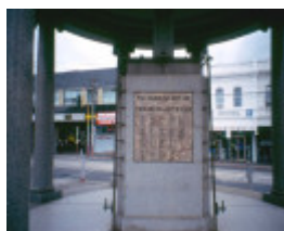
Kew War Memorial Honour Board 2004