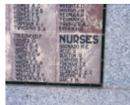
Kew War Memorial Honour Board 2004