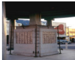
Kew War Memorial Honour Board 2004