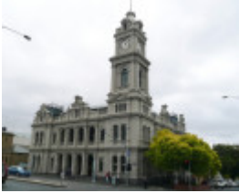
FORMER GEELONG POST OFFICE SOHE 2008