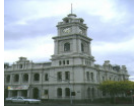
1 former geelong post office geelong clock tower apr1997