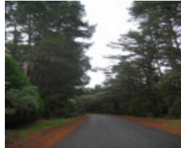
47085 Cat Jump Road, Donvale (2)