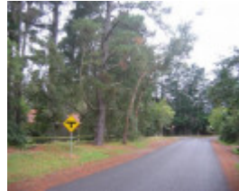
47085 Cat Jump Road, Donvale