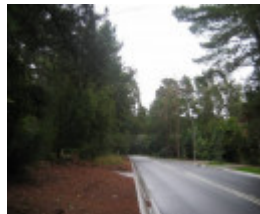
47085 Trees - Old Warrandyte Road, Donvale (looking sth)