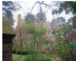
47085 House - 3 Old Warrandyte Road, Donvale