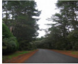
47085 Cat Jump Road, Donvale (2)