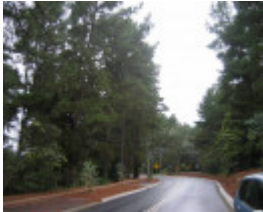
47085 Trees - Old Warrandyte Road (looking north)