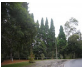
47085 Trees - Old Warrandyte Road, Donvale