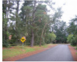
47085 Cat Jump Road, Donvale