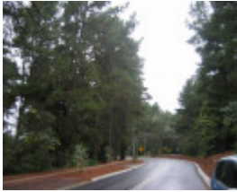
47085 Trees - Old Warrandyte Road (looking north)