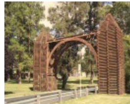
RED GUM MEMORIAL ARCHWAY SOHE 2008 1 red gum memorial echuca front elevation