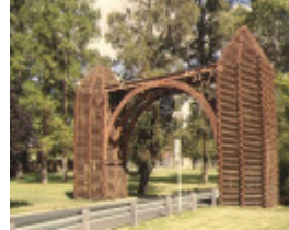
RED GUM MEMORIAL ARCHWAY SOHE 2008 1 red gum memorial echuca front elevation