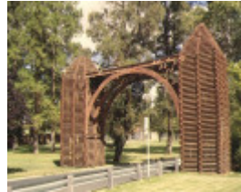
1 red gum memorial echuca front elevation