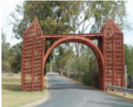
RED GUM MEMORIAL ARCHWAY SOHE 2008