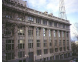
1 the herald & weekly times building flinders street melbourne front view aug1995