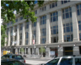
THE HERALD & WEEKLY TIMES BUILDING SOHE 2008