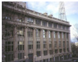
1 the herald & weekly times building flinders street melbourne front view aug1995