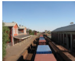
Echuca RWS Complex from North February 2002.