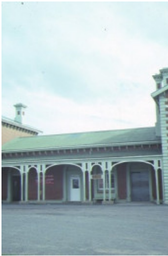
1 echuca railway station complex front entrance jul1984