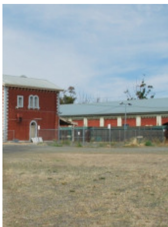
ECHUCA RAILWAY STATION COMPLEX SOHE 2008