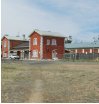
ECHUCA RAILWAY STATION COMPLEX SOHE 2008