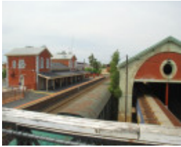
ECHUCA RAILWAY STATION COMPLEX SOHE 2008