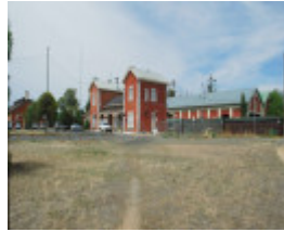
ECHUCA RAILWAY STATION COMPLEX SOHE 2008