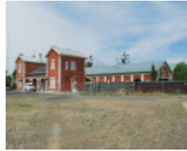
ECHUCA RAILWAY STATION COMPLEX SOHE 2008