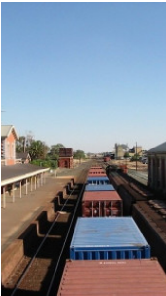
Echuca RWS Complex from North February 2002.