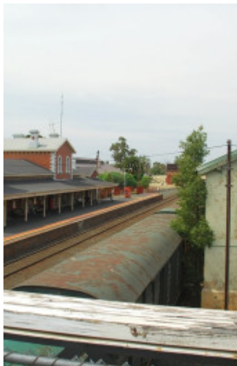
ECHUCA RAILWAY STATION COMPLEX SOHE 2008