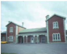
1 echuca railway station complex front entrance jul1984