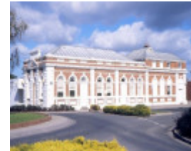
east gippsland regional library service street bairnsdale nicholson st side she project 2003