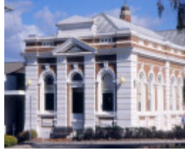
h01284 1 east gippsland regional library service street bairnsdale main entrance she project 2003