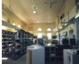
east gippsland regional library service street bairnsdale interior she project 2003