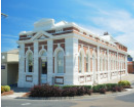
EAST GIPPSLAND SHIRE LIBRARY (FORMER BAIRNSDALE MECHANICS INSTITUTE) SOHE 2008