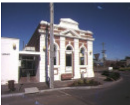
h01284 bairnsdale mechanics institute front view