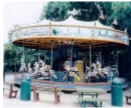
1 carousel H1064 march 1997