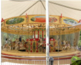
CAROUSEL SOHE 2008