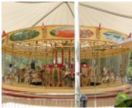
CAROUSEL SOHE 2008