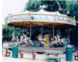
1 carousel H1064 march 1997