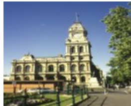
BENDIGO POST OFFICE SOHE 2008 1 bendigo post office front view