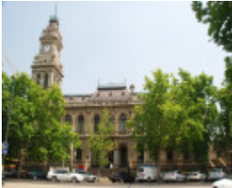
BENDIGO POST OFFICE SOHE 2008