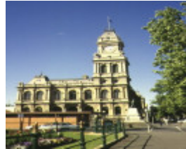
1 bendigo post office front view