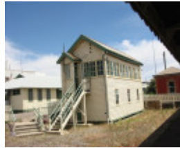
Ararat Railway Station Signal Box A February 2002