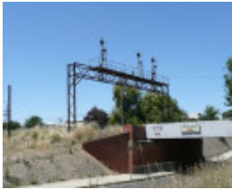
SIGNAL BOX A AND SIGNAL POSTS SOHE 2008