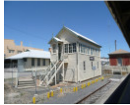
SIGNAL BOX A AND SIGNAL POSTS SOHE 2008