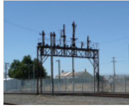
SIGNAL BOX A AND SIGNAL POSTS SOHE 2008