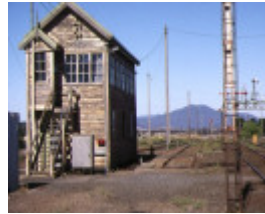
1 signal box & sign posts ararat signal box entrance mar1995