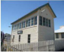
SIGNAL BOX A AND SIGNAL POSTS SOHE 2008