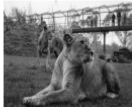
Lion enclosure prior to demolition 2014.jpg