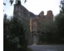
1 royal melbourne zoological gardens royal park parkville rear giraffe house