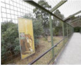
Lion enclosure prior to demolition, 2014.jpg