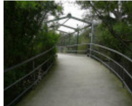
Lion enclosure prior to demolition, 2014.jpg