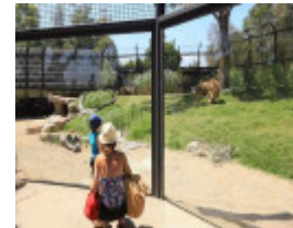
Lion Gorge 2017.jpg