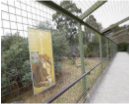
Lion enclosure prior to demolition, 2014.jpg