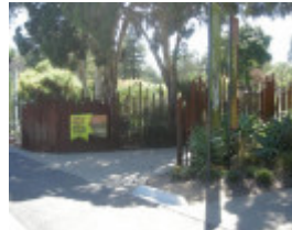
Entrance to Lion Gorge 2017.jpg