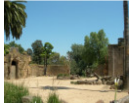
ROYAL MELBOURNE ZOOLOGICAL GARDENS SOHE 2008