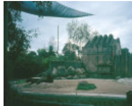
Royal Melbourne Zoological Gardens Royal Park Parkville Elephant House