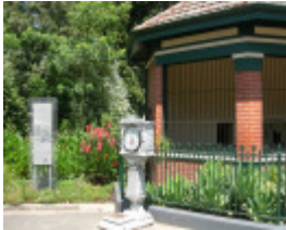
ROYAL MELBOURNE ZOOLOGICAL GARDENS SOHE 2008