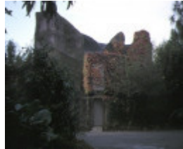
1 royal melbourne zoological gardens royal park parkville rear giraffe house