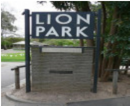
Original sign reinstated at new Lion Gorge enclosure 2017 .jpg