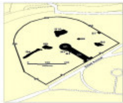
H01074 royal melbourne zoological gardens royal park parkville elephant house plan