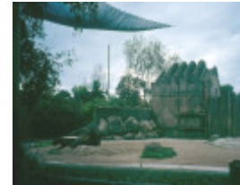
Royal Melbourne Zoological Gardens Royal Park Parkville Elephant House