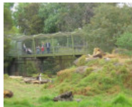
Lion enclosure prior to demolition 2014.jpg