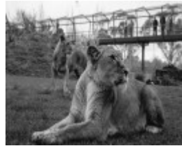
Lion enclosure prior to demolition 2014.jpg