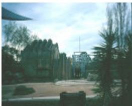
Royal Melbourne Zoological Gardens Royal Park Parkville Elephant House