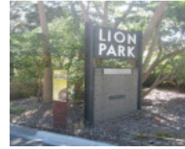
Sign reinstated at new Lion Gorge enclosure 2017.jpg