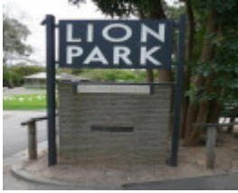
Original sign reinstated at new Lion Gorge enclosure 2017 .jpg