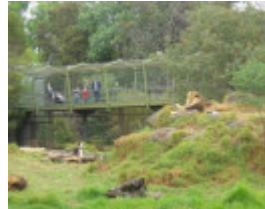
Lion enclosure prior to demolition 2014.jpg