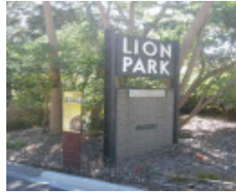
Sign reinstated at new Lion Gorge enclosure 2017.jpg