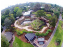
Lion Gorge aerial view 2017.jpg