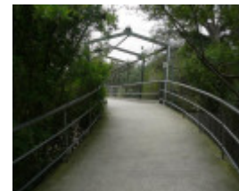
Lion enclosure prior to demolition, 2014.jpg