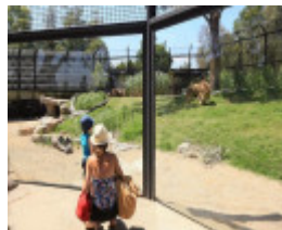
Lion Gorge 2017.jpg