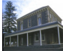
OSBORNE HOUSE SOHE 2008 OSBORNE HOUSE SOHE 2008 1 osborne house geelong front view of house apr1997