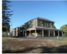
OSBORNE HOUSE SOHE 2008