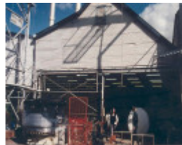
h01099 1 mildara blass distillery merbein