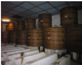
MILDARA BLASS DISTILLERY SOHE 2008