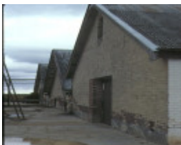
h01099 mildara blass distillery wentworth road merbein entrance to storage area may1983