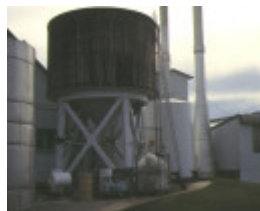
h01099 mildara blass distillery wentworth road merbein tank jun1995