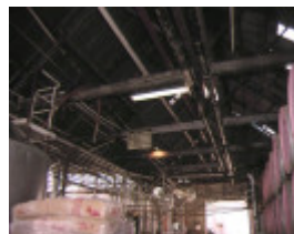
h01099 mildara blass distillery wentworth road merbein interior storage apr1995