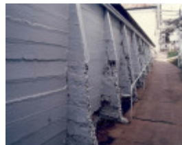
h01099 mildara blass distillery merbein wall of brandy store