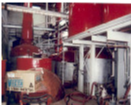
h01099 mildara blass distillery merbein copper pot stills