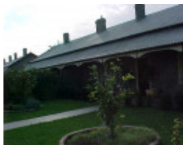
Iron Cottage 181 Brunswick Road Brunswick