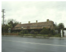
1 iron cottage brunswick road brunswick housing row 1992