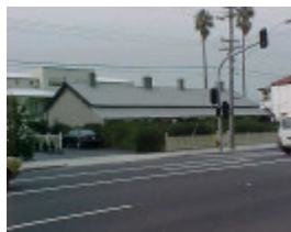
Iron Cottage 181 Brunswick Road Brunswick