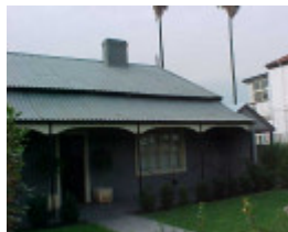
Iron Cottage 181 Brunswick Road Brunswick