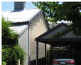
IRON COTTAGE SOHE 2008