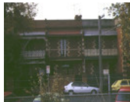
DOROTHY TERRACE SOHE 2008