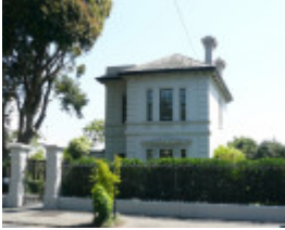
MILTON HOUSE SOHE 2008