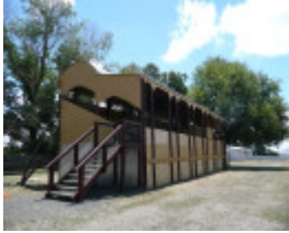
KINGSTON GRANDSTAND SOHE 2008