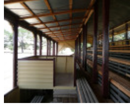
KINGSTON GRANDSTAND SOHE 2008