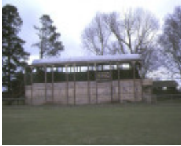
1 kingston grandstand kingston allendale road kingston front view jul1987