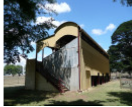
KINGSTON GRANDSTAND SOHE 2008