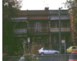
H1039 1 dorothy terrace 36 lulie street abbotsford front view