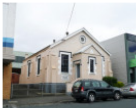
MT ZION PARTICULAR BAPTIST CHURCH SOHE 2008