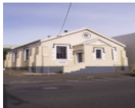
1 mt zion particular baptist church geelong front view apr1997