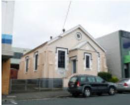
MT ZION PARTICULAR BAPTIST CHURCH SOHE 2008