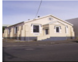
1 mt zion particular baptist church geelong front view apr1997