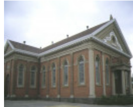
1 st mary's hall geelong side elevation apr1997