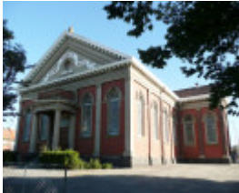
ST MARYS HALL SOHE 2008