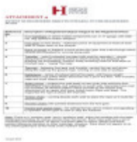
Donaghys Geelong List of Objects Integral 18 April 2019.jpg