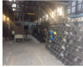
Fomer Donaghys Ropeworks Site 3 Photo Taken June 2018.jpg