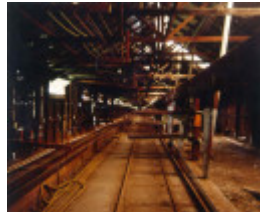
h01169 1 former donaghys ropeworks pakington street geelong finterior apr1997