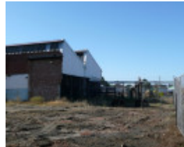
KINNEARS ROPEWORKS SOHE 2008