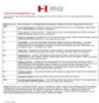
Donaghys Geelong List of Objects Integral 18 April 2019.jpg