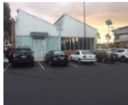
Fomer Donaghys Ropeworks Site 1 Photo Taken June 2018.jpg