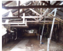
Donaghys Rope Walk 1