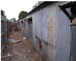
Donaghys Rope Walk 3