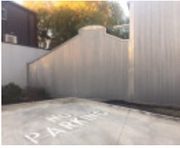
Fomer Donaghys Ropeworks Site 11 Photo Taken June 2018.jpg