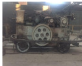
Fomer Donaghys Ropeworks Site 5 Photo Taken June 2018.jpg