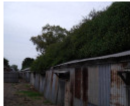
Donaghys Rope Walk 2