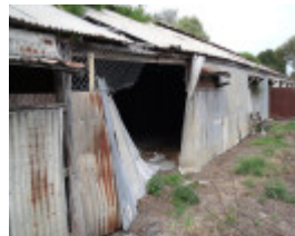
Donaghys Rope Walk 4