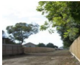
2018 land on which rope walk once sat.jpg