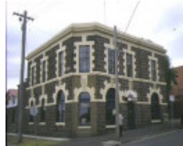
1 former george & dragon hotel geelong front view apr1997