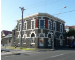
FORMER GEORGE AND DRAGON HOTEL SOHE 2008