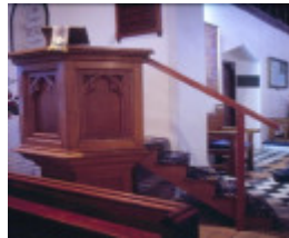
h01125 st george the martyr church and hall hobson st queenscliffe pulpit she project 2003