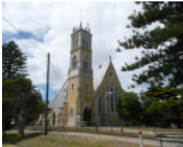
ST GEORGE THE MARTYR CHURCH AND PARISH HALL SOHE 2008