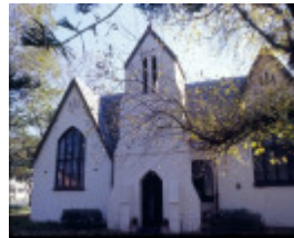
h01125 st george the martyr church and hall hobson st queenscliffe facade school hall she project 2003