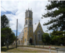
ST GEORGE THE MARTYR CHURCH AND PARISH HALL SOHE 2008