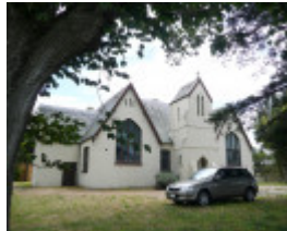
ST GEORGE THE MARTYR CHURCH AND PARISH HALL SOHE 2008