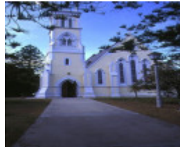
1 st george the martyr church & parish hall hobson street queenscliff front view