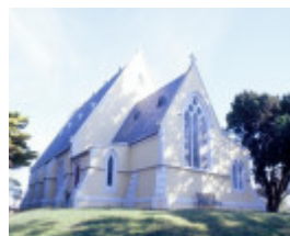
h01125 st george the martyr church and hall hobson st queenscliffe west wall she project 2003