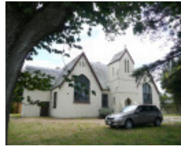
ST GEORGE THE MARTYR CHURCH AND PARISH HALL SOHE 2008