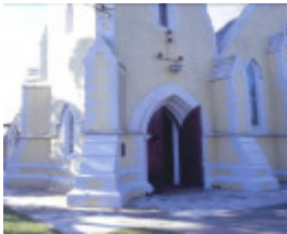
h01125 st george the martyr church and hall hobson st queenscliffe buttresses she project 2003