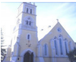
h01125 st george the martyr church and hall hobson st queenscliffe south face she project 2003