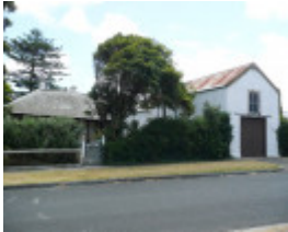
WARRINGAH SOHE 2008