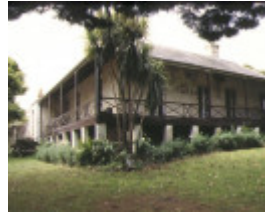
1 warringah mercer street queenscliff front view oct1995