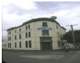
1 terminus hotel geelong front corner view apr1997