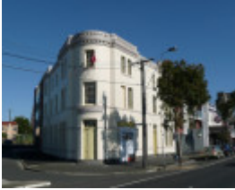
TERMINUS HOTEL SOHE 2008