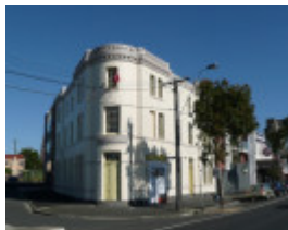
TERMINUS HOTEL SOHE 2008