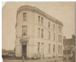
Terminus Hotel, c.1861, acc H13864.jpg