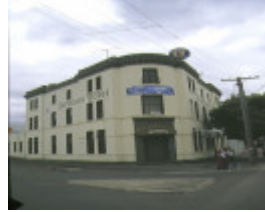
1 terminus hotel geelong front corner view apr1997