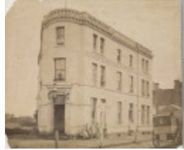
Terminus Hotel, c.1861, SLV, acc H13864.jpg