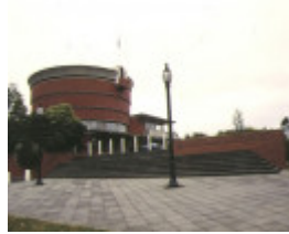
1 brighton municipal offices side view