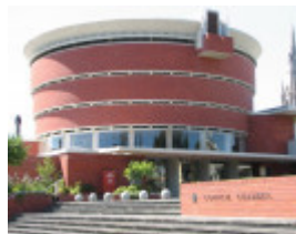
BRIGHTON MUNICIPAL OFFICES SOHE 2008