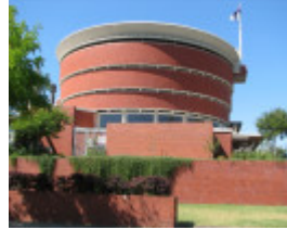
BRIGHTON MUNICIPAL OFFICES SOHE 2008