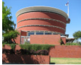
BRIGHTON MUNICIPAL OFFICES SOHE 2008