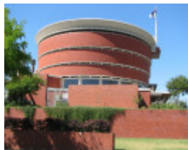
BRIGHTON MUNICIPAL OFFICES SOHE 2008