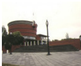
1 brighton municipal offices side view