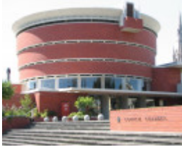
BRIGHTON MUNICIPAL OFFICES SOHE 2008