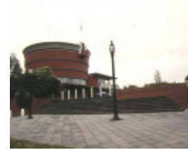
1 brighton municipal offices side view